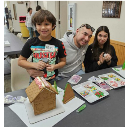
Michael's Place family enjoying time at the Robin's Nest Holiday Gingerbread Decorating event.

Michael's Place is a safe place where you can share your feelings if you want. You will find kindness and love. You will find others that you can make connections with. Adult Group Participant