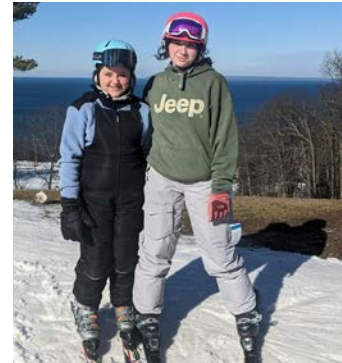
Robin's Nest families enjoying time at the Homestead Resort

Hands-On Healing • Coffee & Conversation • Create-A-Keepsake • Writing Through Loss Educational Workshops & Presentations • Healing Garden